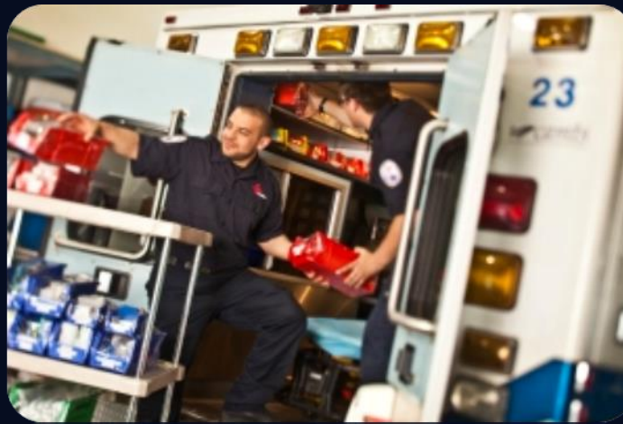
REMSA Vehicle Supply Technician Program

How do you get the ambulance ready for the next call?